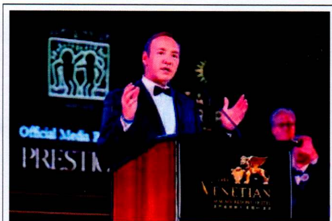
Long-time Best Buddies supporter Kevin Spacey addresses dinner guests

Perhaps the most surprising thing about Kevin Spacey is not that he's a gifted singer, but that he's such a nice, likeable guy.